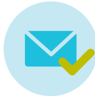
Choose Email Us - Endorsement Request