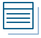
A fillable form will pop-up pre-populated