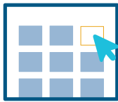
Select Services tile on homepage

*Additional Insured Note: The General Liability Broadening Endorsement provides automatic AI coverage for contractual obligations including primary and non-contributory wording and waiver of subrogation where required.