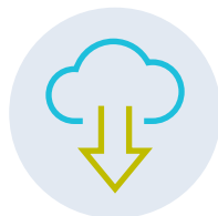
Download supplemental questionnaires

Find common policy forms like frequently request broadening endorsements along with supplemental questionnaires needed to submit a complete application by selecting Applications, Questionnaires and Forms under Doing Business with Us.