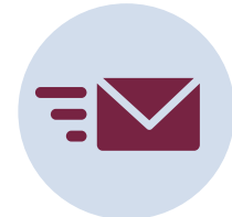
Sign up for email alerts