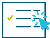
Select the policy you need to report a claim

Reporting a claim is easy through Agent Portal. Simply select the policy for which you need to report a claim under Inforce/Future Policies and choose Submit A Claim . A fillable form will pop-up with pre-populated policy information.