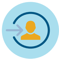
Login to Agent Portal to view tools

You can sign up for portal or email alerts to receive a notification when billing or policy activity occurs. This feature will let alert you when a new policy is issued, endorsements are made or you have a new notice of cancellation or rescission. To turn on your policy or billing notification preferences refer to the Notification Quick Card .